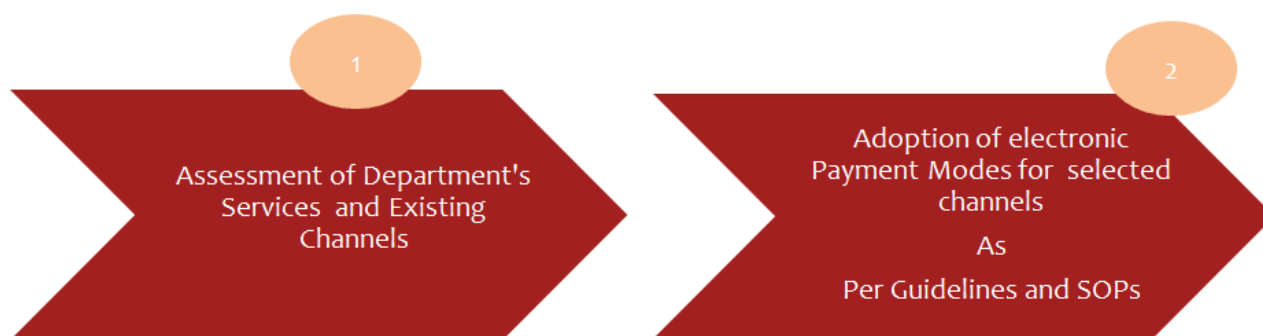
Figure 2: Implementation Approach

The implementation approach for the EPR framework can be defined as a two-step process. It primarily addresses assessment of services offered by the Departments to internal and external stakeholders, identification and adoption of delivery channels and usage of options for electronic payments for payments and receipts from/to department: